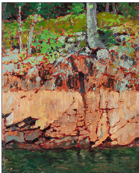
"The Battlement, Lake of the Woods" by Franz Johnston (1888-1949), oil on board, 13 by 10½ inches ($17/23,000).