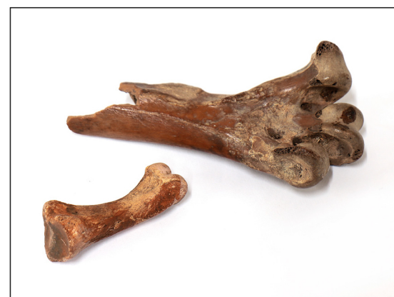
Dodo femur and phalanx bones, Mauritius, before 1690. Leg bone, 3 inches long, toe bone, 1½ inches long ($4/5,300).

animals and warriors. Smoking was conventional in Haida society prior to the arrival of European settlers, however, the view on smoking was changed with the introduction of guns and firearms. Some of the earliest Haida pipes encountered are out of old gunstocks of defeated settlers, as it was believed that the power exerted by them could be harnessed through this conversion. It is estimated at $650-$1,050.