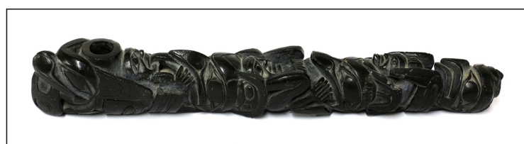
Carved Haida argillite pipe, Northwestern United States or Southwestern Canada, early Nineteenth Century, 11 inches long ($650-$1,050).

verted from GB Pounds to US Dollars based on the conversion rate at press time and may dif-